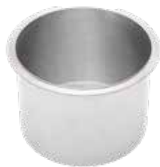
Cryogenic Process Inner Bowl, 5 L