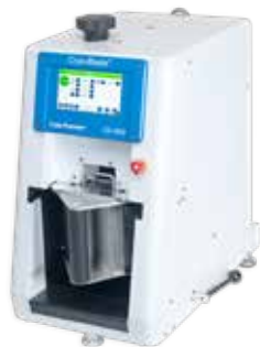
CG-900 Cryo-Blade™ Cryogenic Grinder

What's included: Cryo-Blade unit, insulated outer bowl, inner bowl, cryogenic processor lid with blade USB memory stick, and instruction manual.