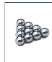
#2305-28 2.8 mm Stainless Steel Balls

#2250 – pre-cleaned polycarbonate, short form 15 mL vial set, preloaded a 11 mm stainless steel ball