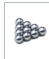
#2305-28 2.8 mm Stainless Steel Balls

#2305-2800SS – 2.8 mm stainless steel balls