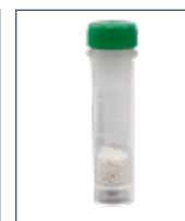
#2305-2800SS Pre-filled 2 mL Vial