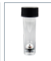
#2240-PC Pre-filled 2 mL Vial